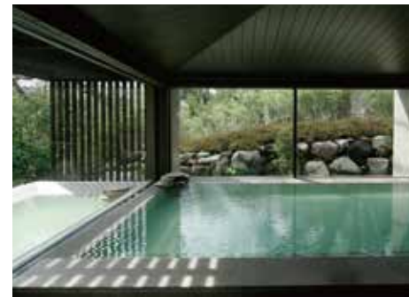
Open-air and indoor baths