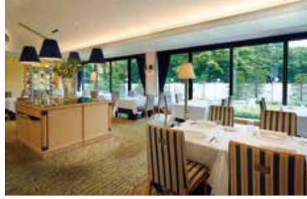
Restaurant "La Forêt"